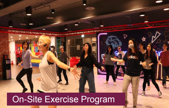
On-Site Exercise Program