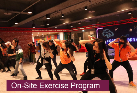
On-Site Exercise Program